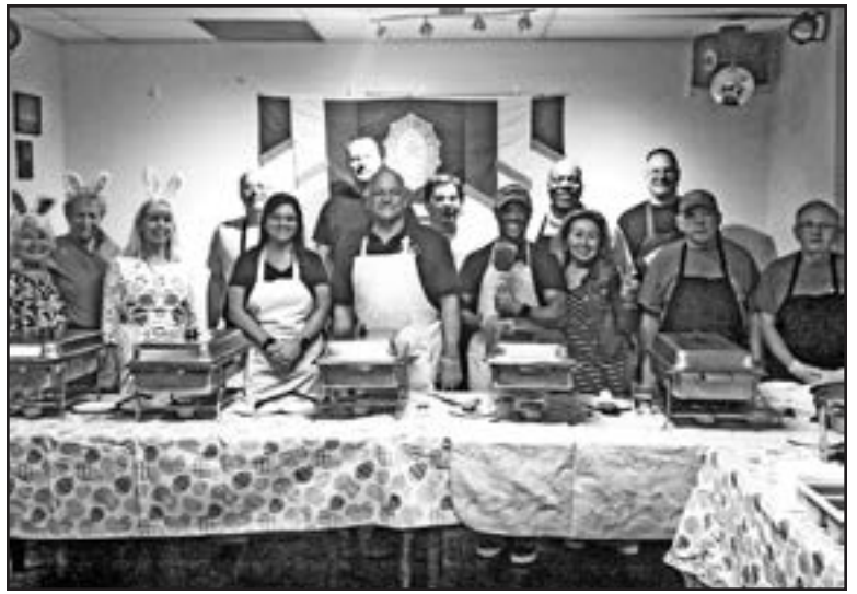
Once again, the Post 1 Color Guard served a great Easter Sunday breakfast. Thank you to all who participated in supporting this event. Don't forget about their next event, the annual car and motorcycle show in July.

YOU are a member, please help us grow our voice even stronger. Invite another veteran to join us, in our time-honored cause to proudly strengthen America, one member and one community at a time.