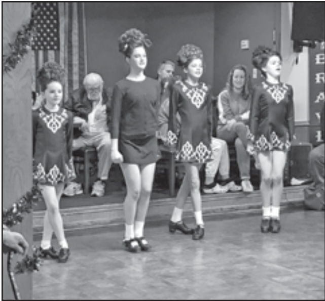
Wick School of Irish Dance students performed.