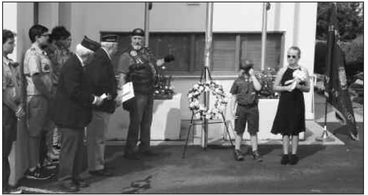
Dedication of the Tomb of the Unknown Soldier Never Forget Garden at the entrance to Post #1.