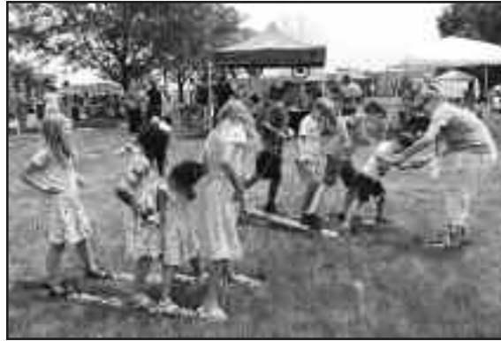
The kids' games.