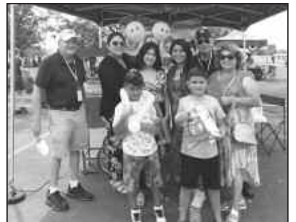
Members from LCW Post 1 Legion Families joined in supporting the family picnic for the 193rd MP Battalion.

National Wreath Laying Day December 18, 2021