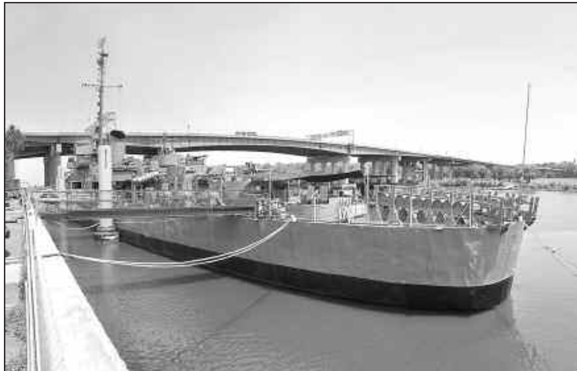
The USS Slater is now a museum ship on the Hudson River in Albany, New York, the only one of its kind afloat in the United States.

The ship was moved to Albany, NY, in 1997 where it still resides today. Thanks to the tireless efforts and hard work of countless volunteers and staff, her once rusted and decaying skeleton is now a living and breathing memorial to destroyer escorts. USS Slater is a National Historic Landmark and receives no regular Federal, State or local government funding. For information on guided tours, donations or more information on this vessel, please visit www.ussslater.org .