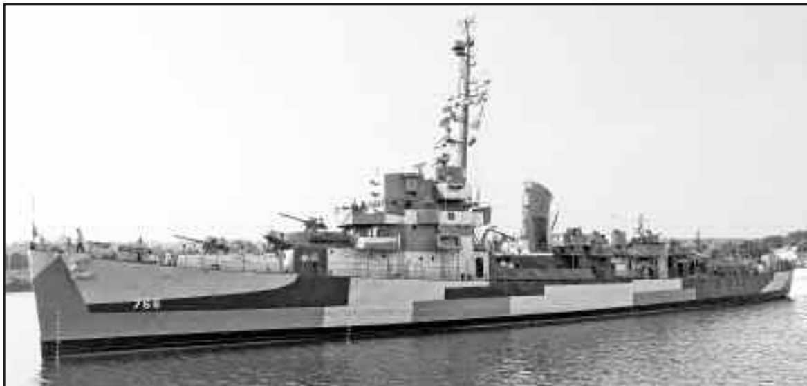
Returning from drydocking in 2014. Heading up the Hudson River toward Albany and home.