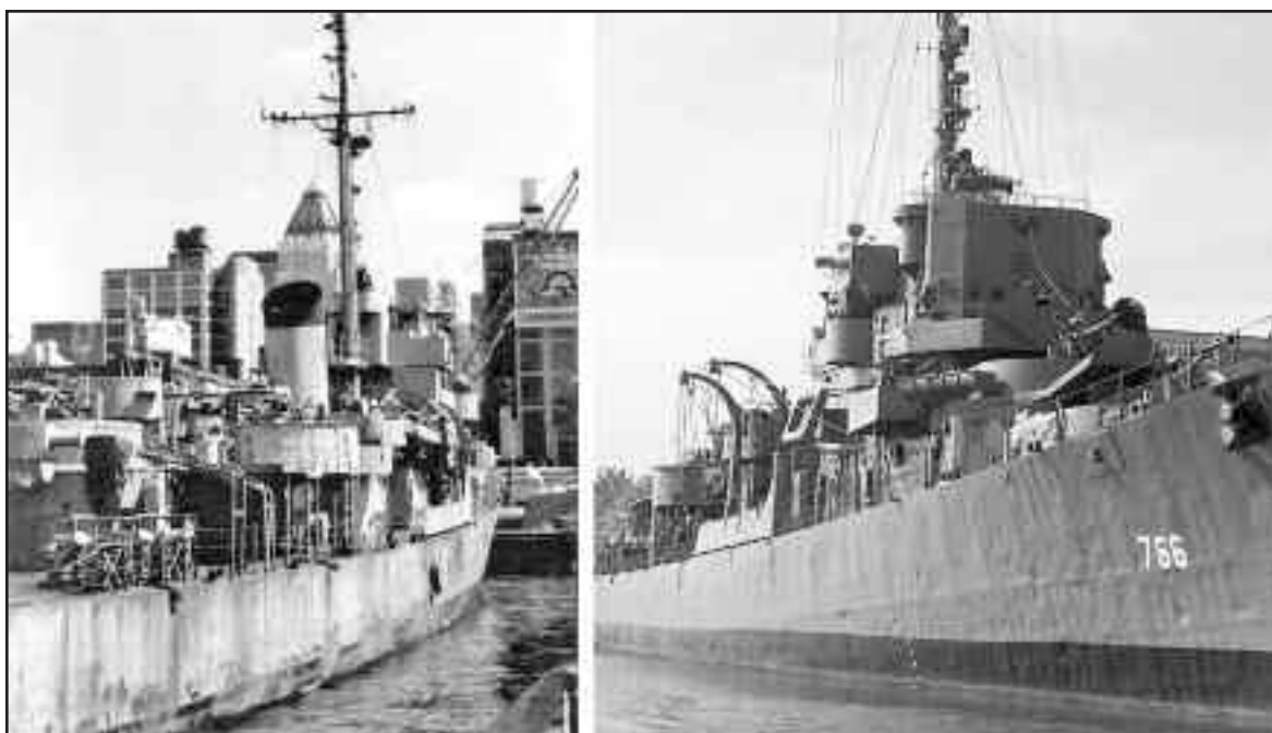
USS SLATER/HNS AETOS, before and after. At left, the terrible condition of the ship in 1993 upon her return to the U.S. after over 40 years in the Greek Navy. At right, a recent photo showing the remarkable restoration work.